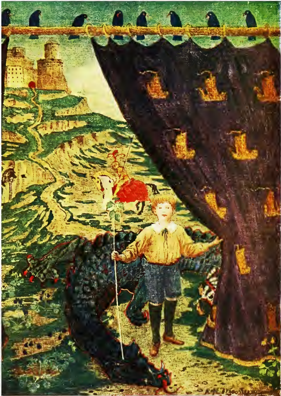
"ONCE MORE WERE DAMSELS RESCUED DRAGONS DISENBOWELLED..."